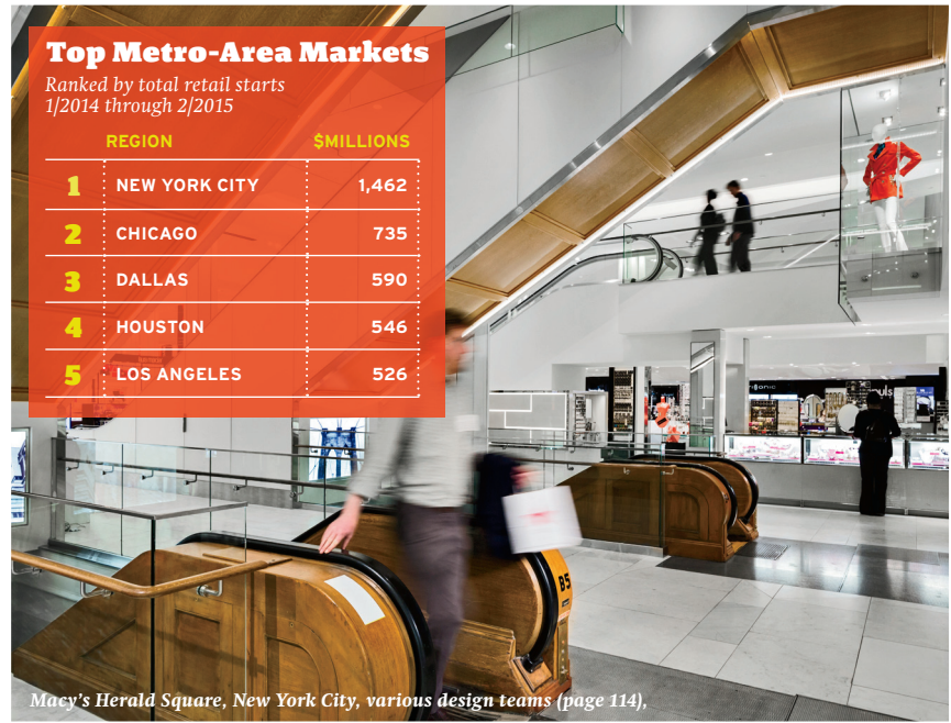
Macy's Herald Square, New York City, various design teams (page 114).