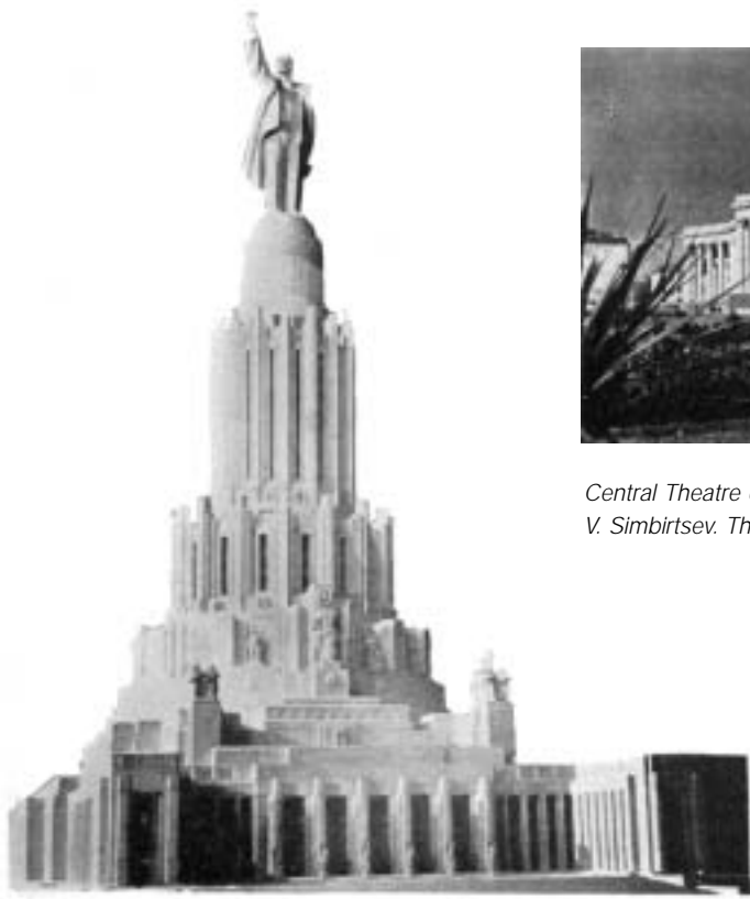
The Palace of Soviets. Architects B. Yofan, V. Gelfreich and V. Shchuko won 1931 competition. Birth of "Soviet Realism."