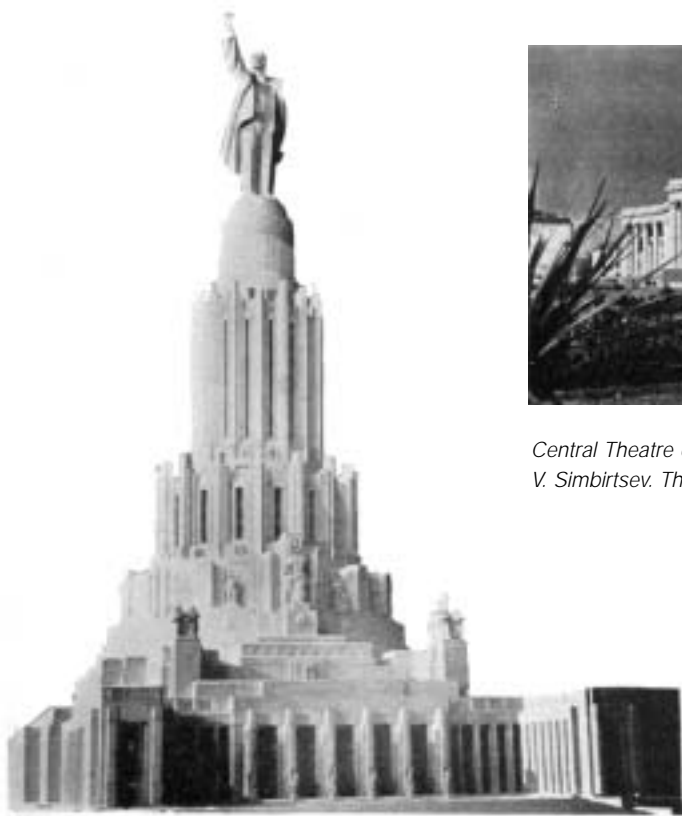
The Palace of Soviets. Architects B. Yofan, V. Gelfreich and V. Shchuko won 1931 competition. Birth of "Soviet Realism."