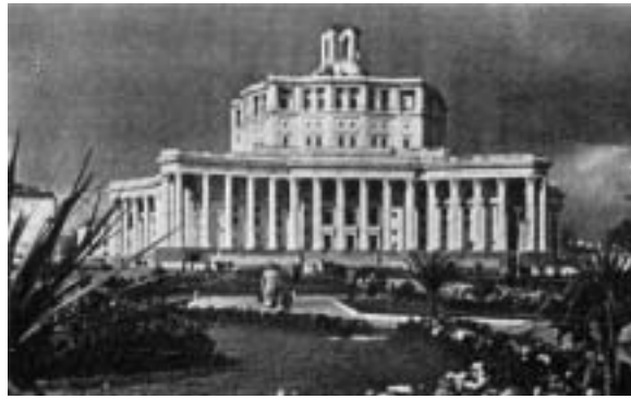
Central Theatre of the Soviet Army. Architects K. Alabyan and V. Simbirtsev. The Red Star shaped plan was approved.