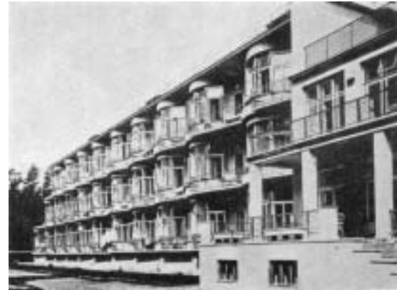
Barvikha Sanatorium. Architect B. Yofan. Relapse into “poverty of spirit and nihilism.”

ference of Dramatists, in November, 1946, Soviet artists were told by propagandist Constantin Simonov: “Too often have we failed to realize that we have fought, are fighting, and will continue to fight; and that our art is no museum of historical arms, but an arsenal intended for war! ”