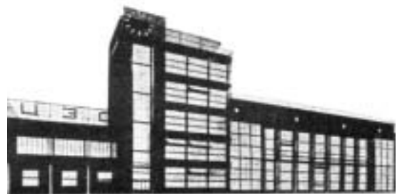
Design for Power Station at Kiev. Architect Burov is accused of “slavish deference to . . . decadent . . . architecture” in U. S.

Pravda, whose editors abhor modern architecture, is printed in this “perverted, and soulless barracks—of bad artistic taste.”